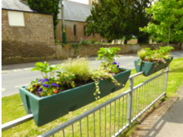
Fun, edible plants outside school gates