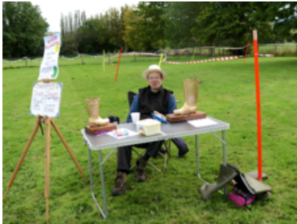
Many volunteers helped make the Ash Fun Day a success. Thanks go to all those residents and local businesses that donated prizes for the tombola and raffle.