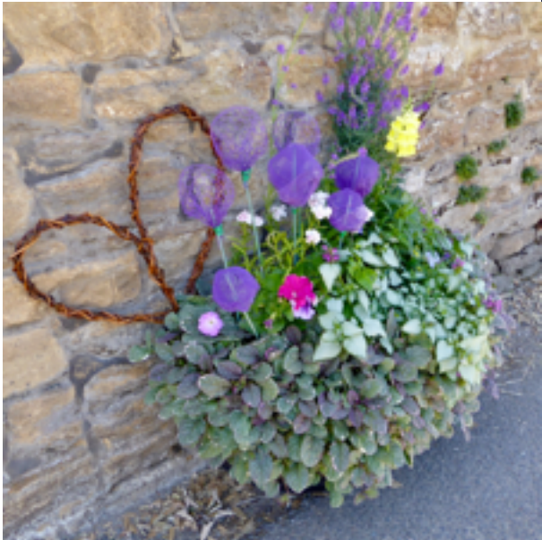
Half barrel planter at the Book Exchange