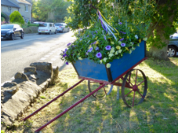
Old pony cart installed on the green at the corner of Main Street and Burrough Street