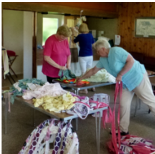
The Craft Group and the Purple Patchers are working on a Poppy Cascade for a First World War Remembrance display at the Welcome Stone in November.