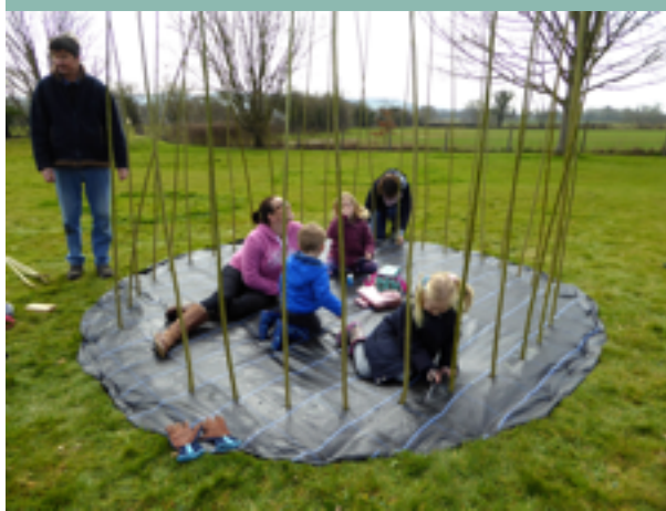
Young Bloomers helped construct the living Willow den .....