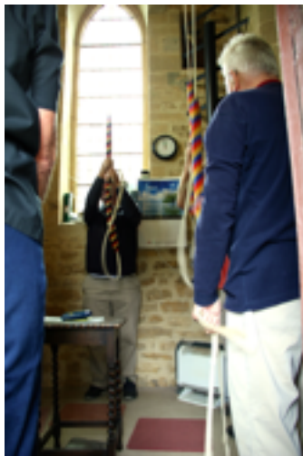
The Bell ringers from Holy Trinity Church will be on hand with a welcome peel for the judges.