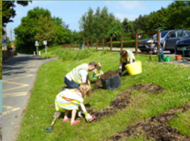
took their turn watering .....