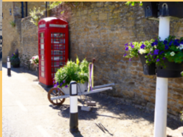
More interest around the Book Exchange