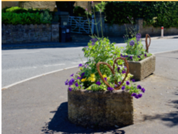
Planters by Main Street noticed board