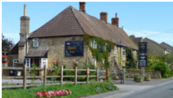
The Bell Inn is one of our oldest buildings and parts of it date back to the late 16th Century.

Holy Trinity Church by comparison is much younger, it's foundation stone was not laid until 1840. The first schoolroom was erected soon after in 1846 and was used for village functions until the Village Hall was built in 1960.