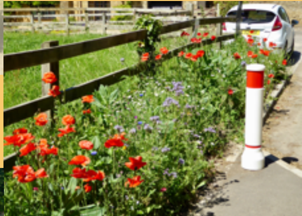
Wild flowers at village entrance