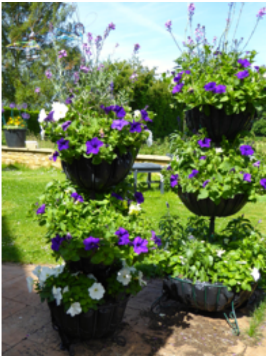
Tower planters for entrance to the Recreation Ground