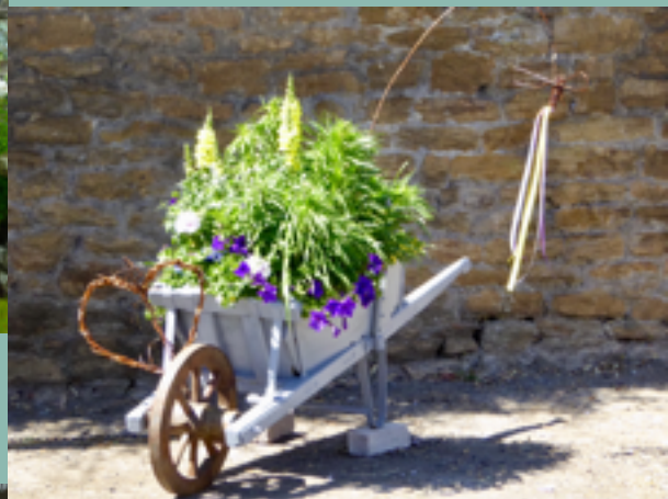
Competition winners were announced at the Ash Fun Day