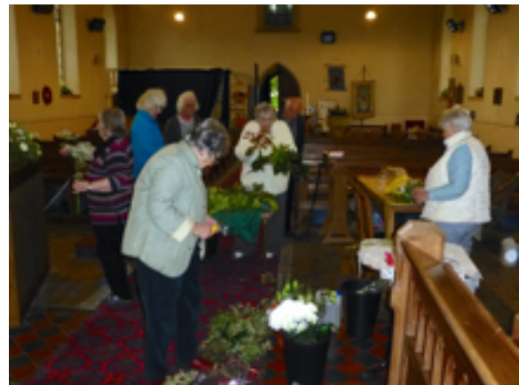
Flower arrangers at the church will be displaying their artistic creations.