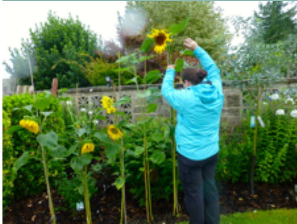
Judging the Children's Tallest Sunflower

Floral and photographic competitions for adults and children were launched for the first time last August, engaging more people and helping the village look it's very best.