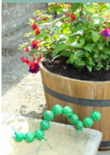
made interesting bugs from old golf ball to enter into the Ash in Bloom Children's Competitions