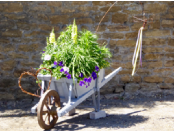
A traditional wheelbarrow adding more interest at the Book Exchange in Main Street - full of bee loving plants