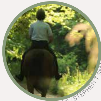
WTML/STEPHEN T SMALLMAN