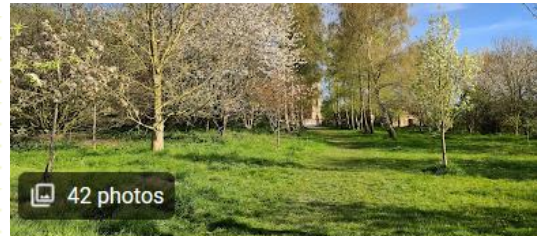
Ash Millennium Wood

There is also a business page on Google Maps: Ash Millennium Wood - Google Maps where visitors leave reviews of their experience on the site.