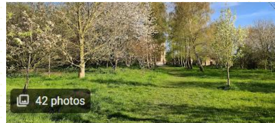
Ash Millennium Wood

Occasional articles are placed in the village newsletter and "The Pinnacle" (a publication covering a number of local villages). Involvement in the Ash Biodiversity Action Group enables information sharing and updating on activities.